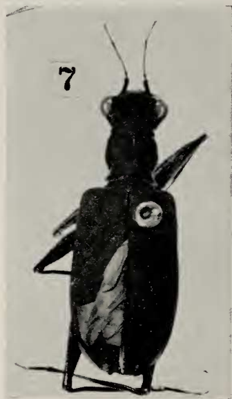
Figs. 6-7. Cicindela darlingtoni , n. sp. Fig. 6, male; fig. 7, female.